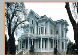
Access Control: House