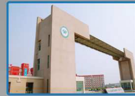
Networked Security: School