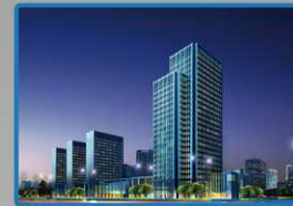
Networked Security: Building