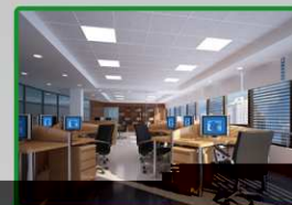
Time Attendance: Office