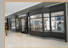
Access Control: Shop