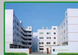
Time Attendance: Factory